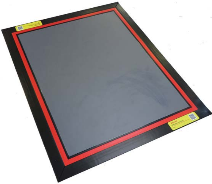
EXAMPLE OF THE FLOATING FLOOR MAT